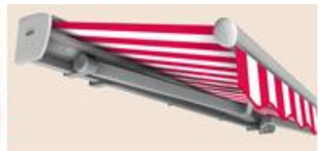
Family Basic (WITH HOOD)