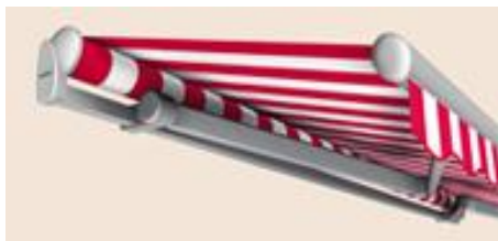
Family (NO HOOD)

The Family Basic combines a stylish design with high quality materials and sleek construction, with max. 11m width and max. 4m extension, this design is suitable for any area.