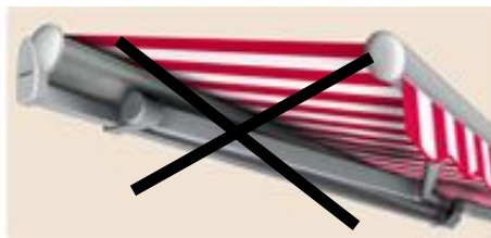
NO LONGER AVAILABLE